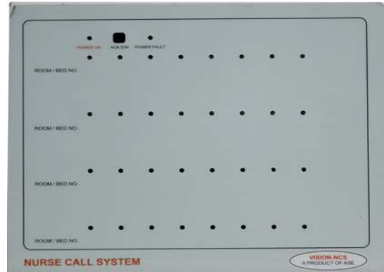
(Nurse Call Display)

This Nurse call display is the device used to call the nurses by the patients from the bed. If the patients got emergency then the patients should switch on the bed switch button in order to call the nurses from the nursing center. This nurse call display is used for the satisfaction of the patients. The nurses are the driving force behind patient satisfaction and they deserve to have a communication system that makes their job easier.